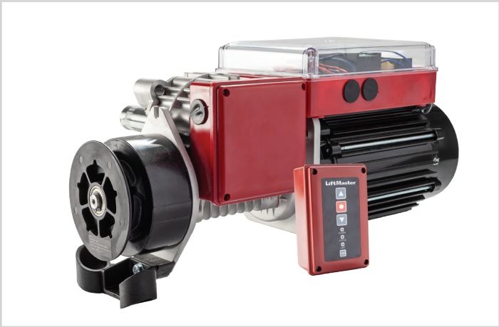
Product may differ slightly from image shown.

E-Drive Operator, Wall Control, Mounting Hardware